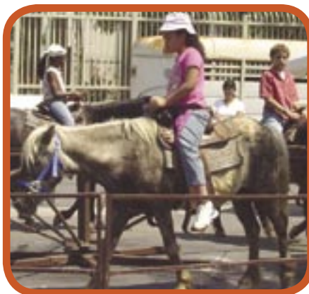
Children enjoy pony rides.

USC School of Dentistry's mobile unit provided 105 free examinations; Department of Health Services provided Healthy Families and Medi-Cal information and enrollments; PACE Head Start successfully enrolled 30 children in its preschool programming; USC Kid Watch and California Highway Patrol informed families about safety resources; and Figueroa Corridor Association, El Clasificado , and USC Explorers provided volunteers to help staff the event.